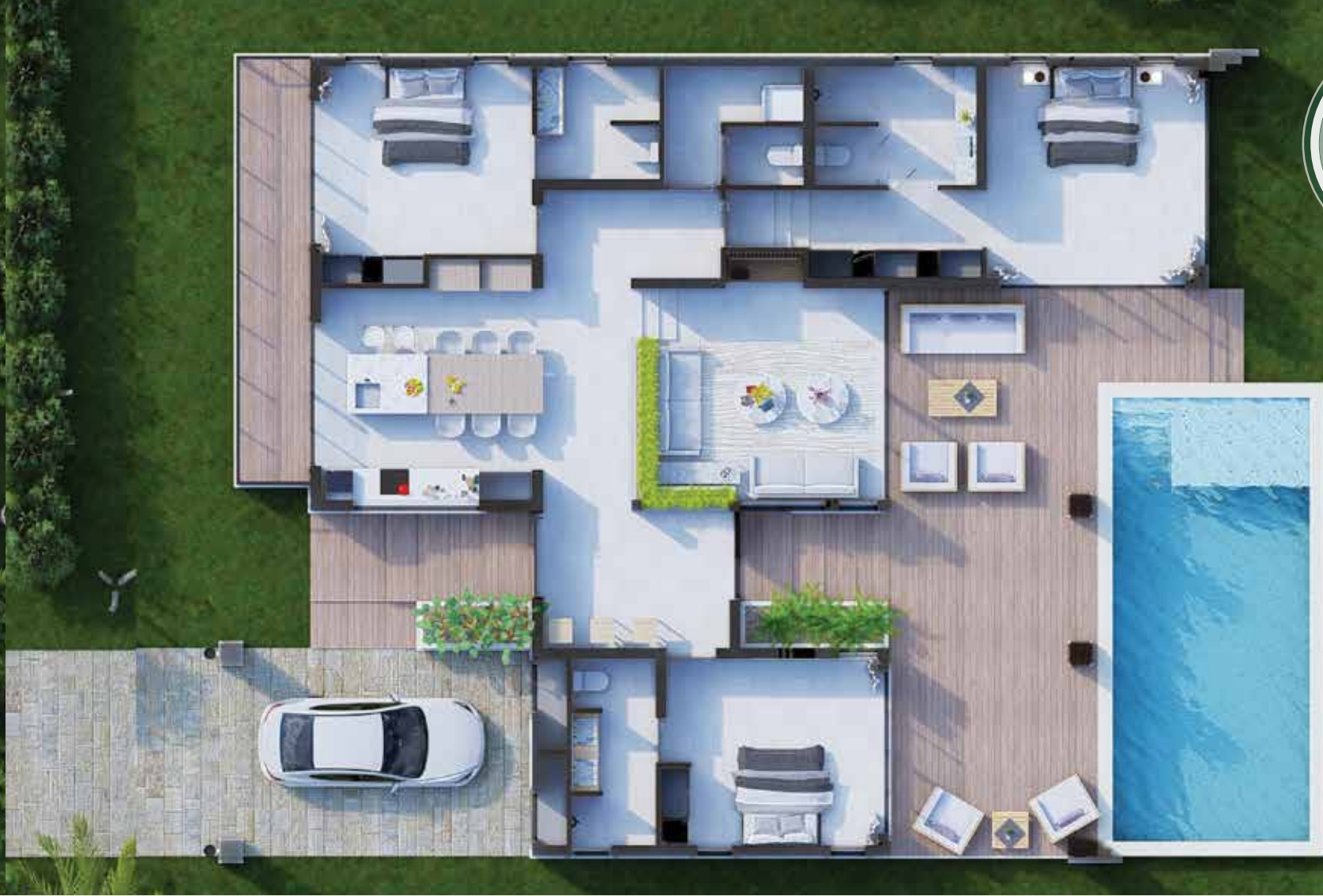
3 BEDROOM DELUXE