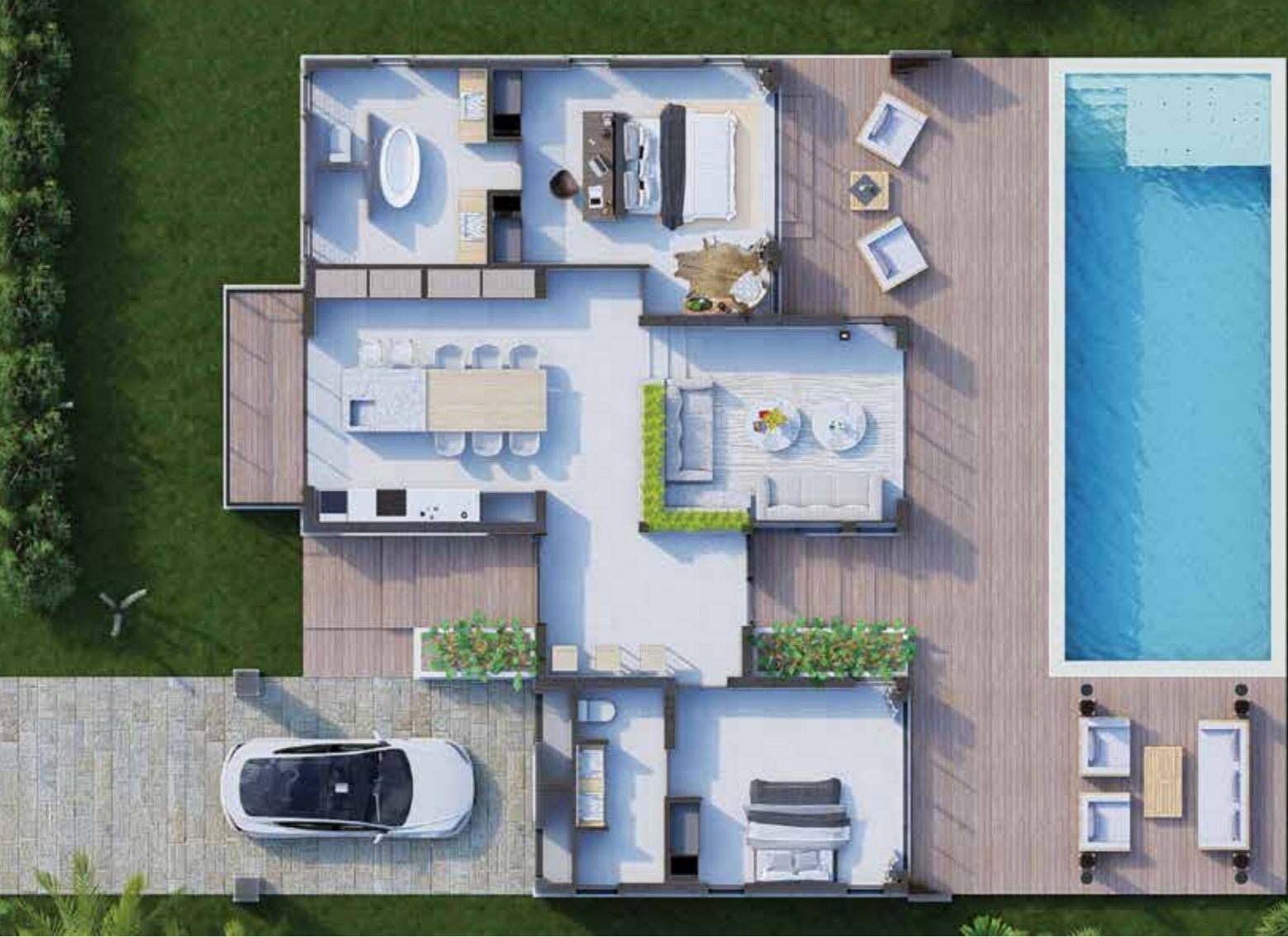
2 BEDROOM DELUXE